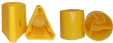
Triangle Safety Cap