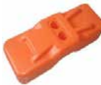
Concrete Filled Foot